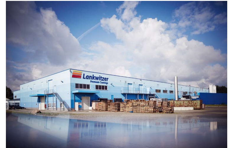
Lankwitzer Lackfabrik GmbH