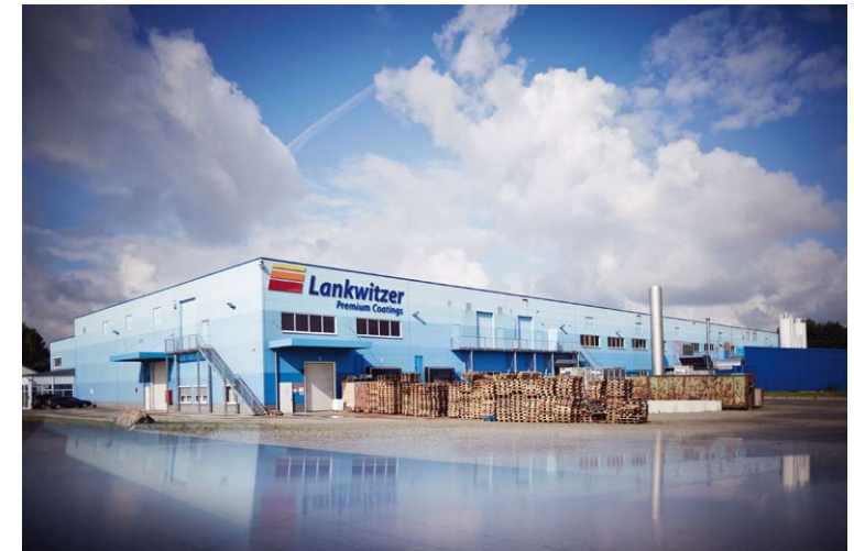
Lankwitzer Lackfabrik GmbH